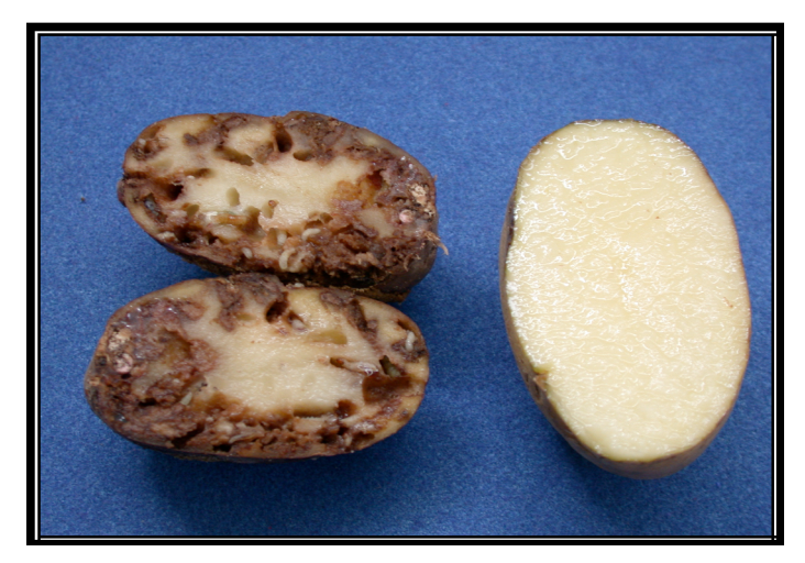
Figure 2. Potato infested with Guatemalan potato moth, Tecia solanivora.