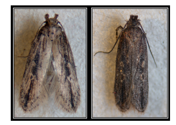
Figure 1. Guatemalan potato moth, female (left) and male (right) (Photo by Felipe Bosa).

The Guatemalan potato moth Tecia (Scrobipalpopsis) solanivora (Povolny, 1973) was introduced to South America by imported potato tubers from Costa Rica, Central America, first to Venezuela in 1983, to Colombia in 1985, and to Ecuador in 1998 (Pollet, 2001; Pollet et al. 2003) (Figure 1). Recently this pest has also been detected in the Canary Islands in Spain (Pemberton, 2001; Barragán et al. 2004).