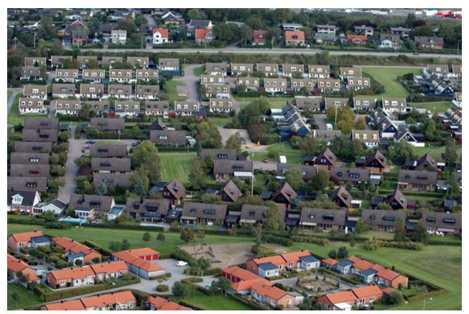
Figure 2. Photograph from Glumslöv.

Both towns contained a large number of municipal playground units, 12 in Glumslöv and 10 in Degeberga, together with a few playgrounds with other management, e.g. housing companies. This means there is one municipal playground per 160 inhabitants in Glumslöv and one per 130 in Degeberga, compared with one per 660 on average for 23 Swedish municipalities studied (Jansson, 2008). The extreme in the chosen cases is that they have retained surprisingly much of traditional playgrounds and the standard-influenced playground provision, with many playgrounds spread out according to former standard distances.