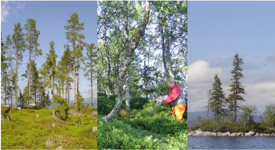
Figure 2. The Swedish island chronosequence. Images from typical large (left), medium (middle) and small (right) islands.