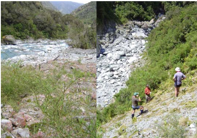
Figure 3. Primary successional surfaces in the Kohkatai Valley, Westland, New Zealand. Carmichaelia odorata growing on a river bank (left) and fieldwork on a recent landslide (right).

Papers I-III were based on field studies on the Arjeplog island chronosequence, where individual islands constitute independent replicate ecosystems (Wardle 2002), with ten islands in each of the three groups small, medium and large islands. The islands together function as a ‘natural experiment’ (Fukami and Wardle 2005), in which variation in island size determines wildfire history, but across which all other extrinsic driving factors remain relatively constant. This range of fire histories in turn causes a gradient of various ecosystem properties and process rates, including productivity, microbial activity, concentration of humus N, phenolic compounds, litter quality and plant species succession (Wardle et al. 1997, 2003). The work reported in Papers I-III is based on sampling and measurements across this natural experiment. Sampling on each island took place in a 20 x 20 m study area, placed at equal distance from the shore for all island size classes, to minimize differences in edge effect (Wardle et al. 2003).