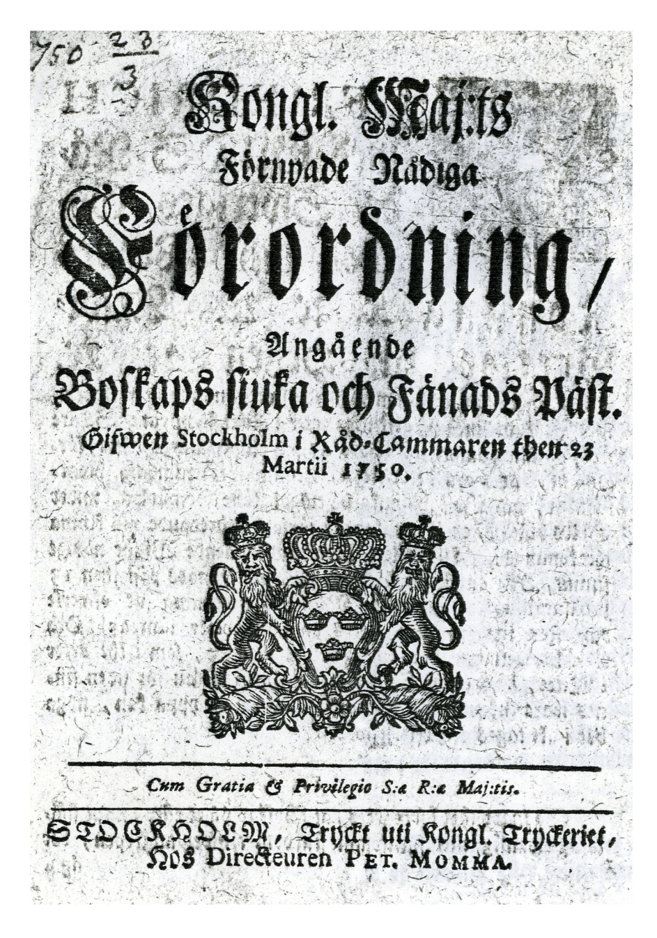
Figure 1. Swedish regulation on the control of the cattle diseases 'Boskaps sjuka' and 'Fänads päst' from 1750, although not strictly defined, probably one of them refers to rinderpest.