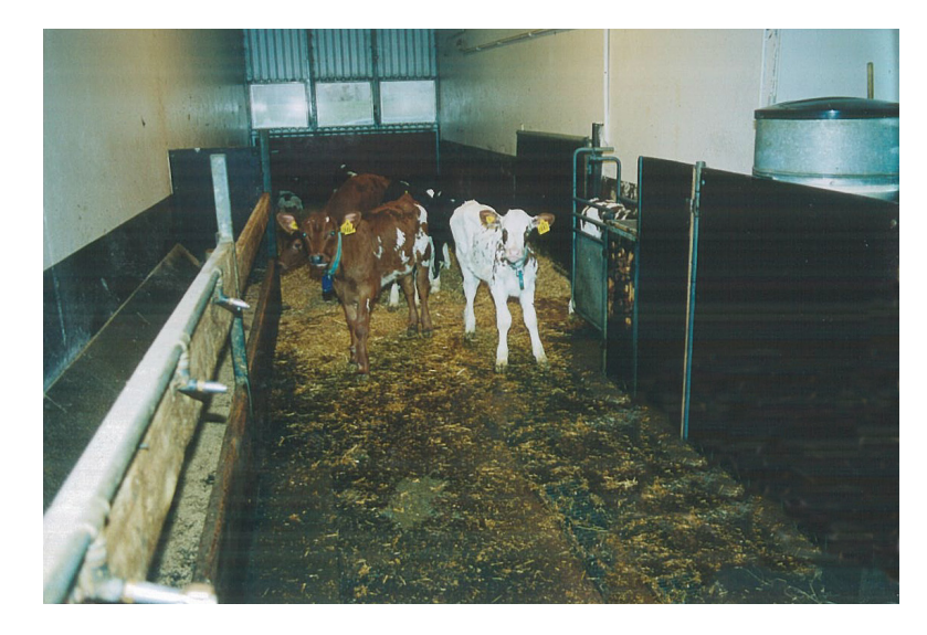
Figure 3. Large group pen with automatic milk feeding system.