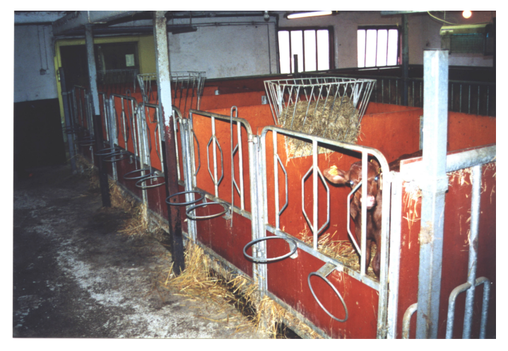
Figure 1. Single pen.

The second most common housing system for young calves is the small group pen (Bernes, Martinsson & Pettersson, 1986; Norrman, 1990; Stenebo, 1995). The small group pen may have a variety of appearances and usually houses up to six calves. According to the current Swedish animal welfare legislation, each calf weighing less than 60 kg should have a total area of at least 1.5 \text{ m}^2 , of which 1.0 m<sup>2</sup> must be a resting area (for calves weighing between 60 kg and 90 kg, the corresponding areas are 1.7 \text{ m}^2 and 1.2 \text{ m}^2 , respectively). Milk is usually fed in buckets and water is usually provided by nipple drinkers (Figure 2).